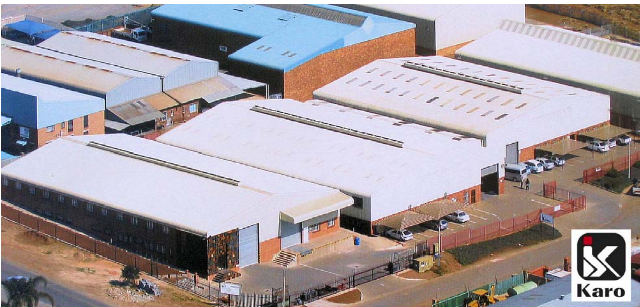
Karo factory, South Africa